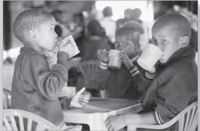
Tea-time at a day care centre in Gaborone, Botswana.