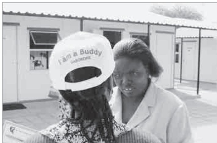
Buddies at the Coping Centre for People Living with HIV/AIDS (COCEPWA), Gaborone, Botswana.