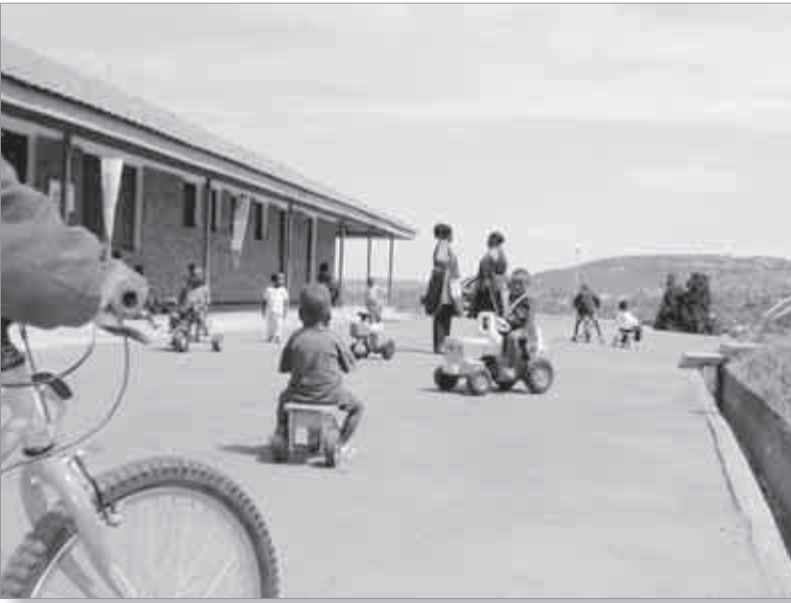
Fun and physiotherapy at Jajja's Home.