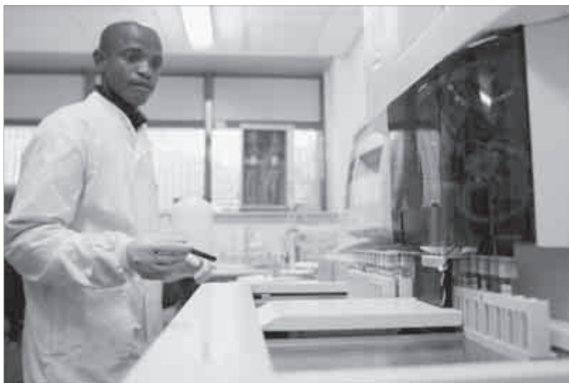
Testing at the Botswana-Harvard HIV Reference Laboratory in Gaborone

assistance from the Botswana-Harvard AIDS Institute Partnership. A much smaller, but equally modern, laboratory has also been set up in Francistown, the site of one of the earliest treatment centres, with assistance from the US Centers for Disease Control and Prevention (CDC). Together, the two laboratories handle all the CD4 and viral load work