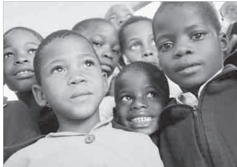
Children attending a day care centre in Gaborone, Botswana.

Uganda is, in many ways, a source of hope to a continent ravaged by AIDS. Having been at the epicentre of the pandemic from the late 1980s to the mid-1990s, it has recorded steadily declining rates of infection over recent years so that, today, about 6.2% of the adult population is believed to be carrying the virus 20 . However, the average masks huge variations (the infection rate ranges from 2% to 25% in different areas and population groups) and HIV/AIDS continues to be a massive problem for Uganda 21 . Virtually no family has escaped the tragedy of extended illness, untimely death and orphaned children.