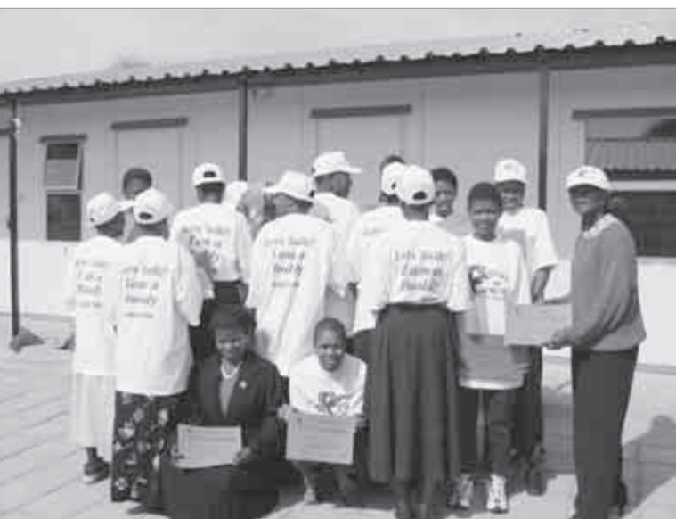
COCEPWA buddies showing off their T-shirts and certificates after a training course.