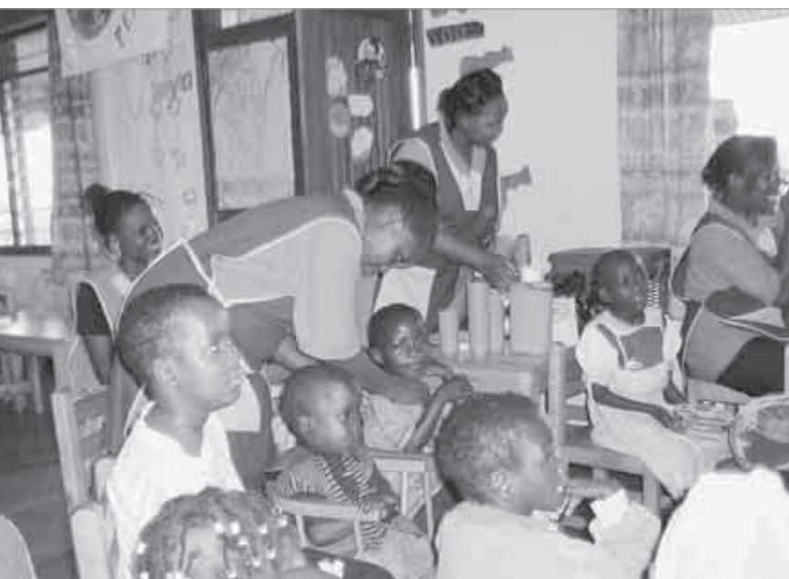
Nurse and care assistants at Jajja’s Home, caring for children with HIV/AIDS.

In September 1998, the London-based AIDS charity, Mildmay International, opened the Mildmay Centre in Kampala as an AIDS referral centre to which severely ill patients with symptoms that were difficult to manage could be sent by other institutions and programmes for help. It is a centre of excellence in AIDS palliative care—particularly the management of pain, which it offers on an outpatient basis. In 1999, Mildmay provided antiretroviral treatment for those who could afford to pay. Jajja’s Home, a Mildmay International project that shares the same hillside site as the Mildmay Centre just outside Kampala, looks after the children and adolescents living with HIV/AIDS.