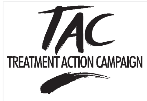
TAC logo from TAC's media archives

Days earlier, on 30 November 1998, they had buried Simon Nkoli, the first black South African man to come out openly as gay, who had become a prominent and inspirational gay rights and AIDS activist. Simon's death was a wake-up call to the AIDS community, says Zackie Achmat, a founding member and now chair of TAC. Simon had recently given an interview to a newspaper, in which he urged people living with HIV/AIDS to picket the Department of Health until it provided the treatment that would stop the dying. Until then, explains Achmat, people in South Africa had known almost nothing of the revolution in treatment going on in the West. Antiretrovirals were considered so unaffordable by developing countries that no one gave them much thought. Indeed, treatment issues in general were not high on the agenda of AIDS activists, who were more preoccupied with prevention and human rights issues. Simon's interview was "a cry of desperation", says Achmat, and his dying so young and so unnecessarily was a powerful stimulus to action.