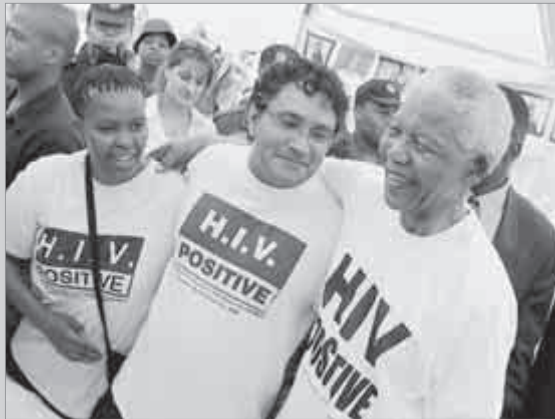
Zackie Achmat and Nelson Mandela with supporters at an event to celebrate the MSF antiretroviral programme in Cape Town, South Africa, December 2002.

“We wrote a letter to the Minister of Health, who was from KwaZulu-Natal, asking her to come,” says Achmat. “Our idea was to get the entire ANC membership in that area, all the health-care workers, the churches, and as many people from the community as we could mobilize. We said, let’s all wear this T-shirt, walk through the township and create a sense of openness.”