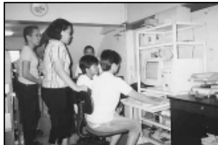
Staff at the Manila-based NGO, The Children's Lab, e-mailing counterparts in Indonesia.

Sustainability: Although the project was only recently completed in a number of countries, a pattern has emerged with regard to ensuring that ongoing electronic access is sustainable. Those organizations, specifically in the Philippines, that incorporated e-mail and/or Internet technology into their daily work processes during the project's term, ensured sustainability regarding continuous funding expansion and strengthening of their e-mail and networking capabilities. The organizations in the Philippines and, increasingly, in Thailand are two examples of sustainability.